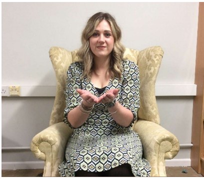
Once upon a time