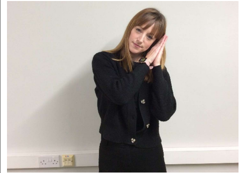
Early one morning