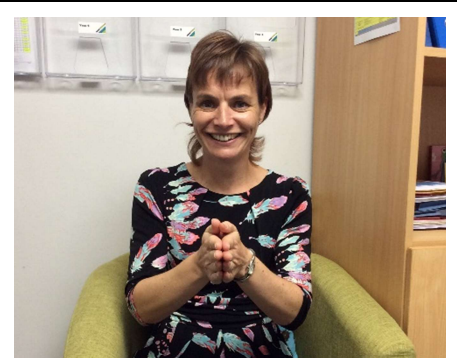
happily ever after